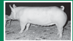
$5,000 Reserve Champion Yorkshire Gilt, 2009 SWTC