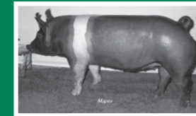
$3,300 Top-selling Champion Hampshire Gilt, 2008 SWTC