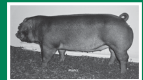
Top-selling $5,400 Grand Champion Duroc Gilt, 2008 NSR Fall Classic